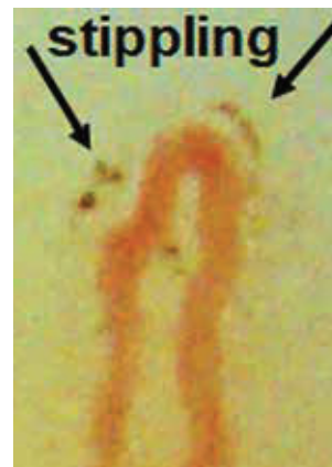
Figure 3. Pericapillary stippling can be seen as pigmented dots round the capillary cap, presumably consistent with capillary leak due to vasculitis, that resulted in hemosiderin deposition

Regarding new target organs in the field of rheumatology, Slobodin et al. [41] described the intrinsic role of entheses in disease pathogenesis of several rheumatic diseases including familial Mediterranean fever, gout, pseudogout, ankylosing spondylitis, and polymyalgia rheumatica [25,42]. Pertinent to diagnostics, Goules and Tzioufas [43] highlighted the increased tendency of Sjögren disease patients in the development of lymphoma. They also described several prognostic markers for the development of lymphoma in such patients. Patients with extra-epithelial systemic manifestations are more likely to develop lymphoma. Moreover, lymphadenopathy, Raynaud's phenomenon, anti-Ro or anti-La positivity, monoclonal gammopathy, and C4 hypocomplementemia have been significantly associated with increased risk of lymphoma development. The identification of prognostic markers allows for the prediction