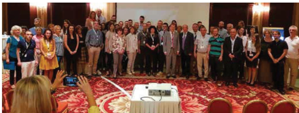
Figure 1. The organizing committee of the Second Greek–Israeli Symposium on Autoimmunity and Rheumatology: Success Through Synergy

The novel immunomodulatory role of B-regulatory cells (B-regs) received extensive attention by Mavropoulos and colleagues [2] who presented data that highlighted the decrease of B-regs in psoriatic arthritis (PsA). The levels of B-regs inversely correlated with the psoriasis area of severity index, IL-17, and IFN- \gamma producing T-cells. Liossis et al. [3] expanded on the role of the B cell class on autoimmunity and stated that the majority of autoantibodies generally produced by immature B